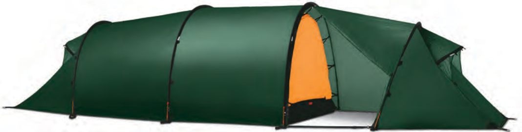
KAITUM 4 GT

THE 2- AND 3-PERSON KAITUM and Kaitum GT models have long been popular with all-season backpackers, climbers, and hunters because of their roominess and light weight. With our new Kaitum 4 and Kaitum 4 GT, adventurers needing larger, 4-person all-season tents now have more options.