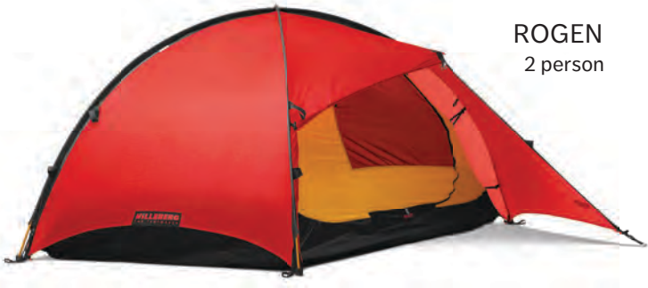
ROGEN 2 person