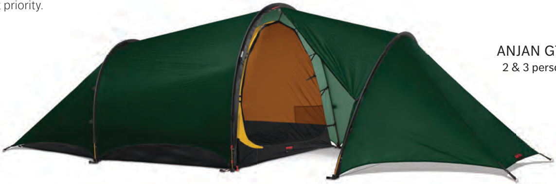
ANJAN GT 2 & 3 person