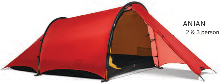
ANJAN 2 & 3 person